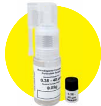
x 12 Trolex compliance sample.