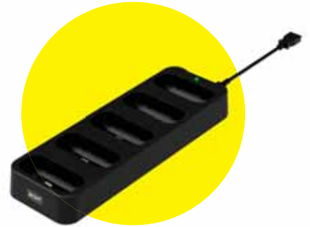
Charging and data dock.