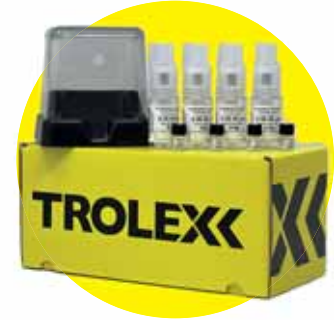
Trolex Compliance Pack +