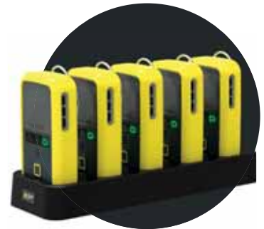
XKD1 + in charging dock.

XKD1 + Team Pack comes with a free charging and data dock.