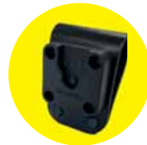
Belt loop dock.